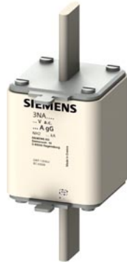
LV HRC fuse element, NH2, In: 400 A, gG, Un AC: 500 V, Un DC: 440 V, Front indicator, live grip lugs